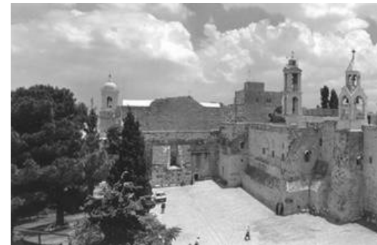
The Church of the Nativity

Jesus' birth is the hallmark event that made Jerusalem's popularity continue for some 2,000 years. Today, there is a church that has been built over a cave area that is said to have served as the stable for the inn when Jesus was born. The church is called "The Church of the Nativity." The church building was commissioned to be built by Constantine in the 326 A.D. It was completed about 333 A.D. and dedicated in 339 A.D. The compound today covers about 12,000 square meters or 129,000 square feet. Three monasteries are housed there: one Greek Orthodox, one Armenian Apostolic, and one Roman Catholic. Within the church, there is a fourteen-point star that marks the birthplace of Jesus Christ. There is an inscription in Latin on the star. In English, it reads: "Here Jesus Christ was born to the Virgin Mary." More people make a pilgrimage to this site than any other associated with the Christian religion. Muslims also hold the site sacred because they venerate Mary and believe Jesus was a prominent prophet of God. Christmas in Bethlehem is truly a special time of year. Thousands and thousands of people gather there to celebrate what they believe to be the birth of Jesus Christ.