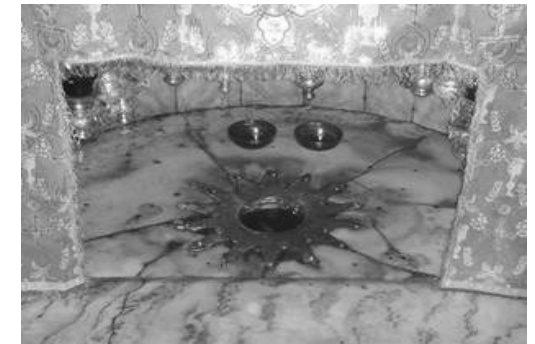
The Fourteen-Point Star that marks Jesus' Birthplace